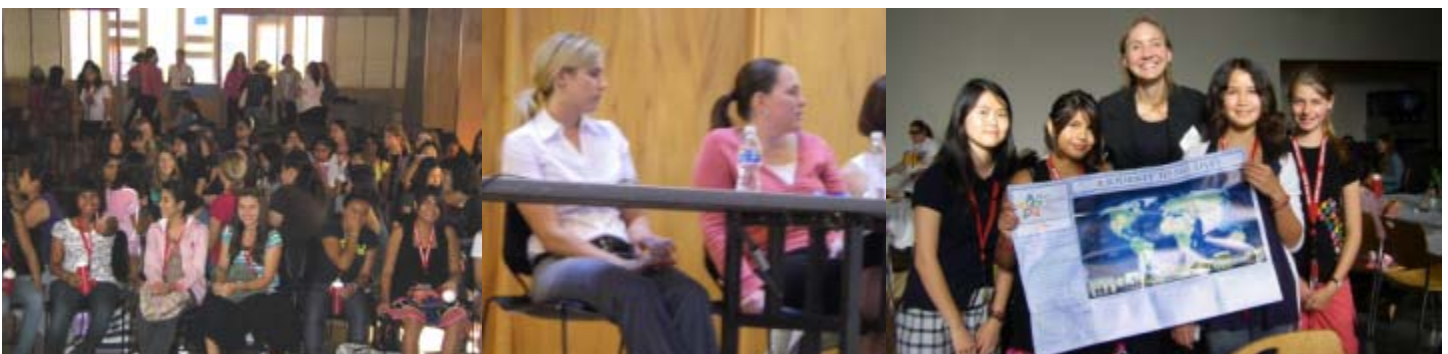
Tech Trek participants at Whittier College (lt) Panelists discuss educational opportunities (ctr) Students participate in environmental global challenge discussions during the professional mentors dinner at Whittier College (rt)

Highlights of this year’s series field activities include: the Challenger Learning Centers Mission to Mars simulation (Fresno and Mills); a Marine Biology boat trip (UC-San Diego and Stanford); visits to the Jet Propulsion Laboratory (Whittier); San Jose Creek WRP (Whittier), and Lawrence Hall of Science (Mills).