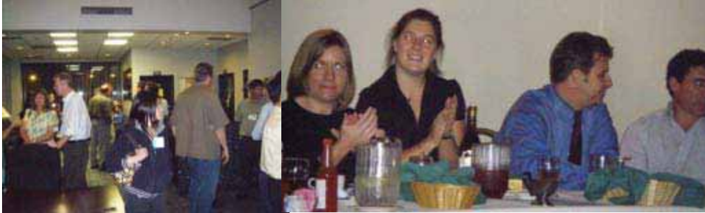
Attendees in the Gulfstream Lobby (left), Presentation at Lakewood Country Club (right)

Roger explained that it is the number of landings that determine the life of aircraft. Several Gulfstream G550's were on site. The Gulfstream G550 is the most technically advanced aircraft of the fleet and can fly up to 51,000 feet at speeds up to Mach .885. Powered by two Rolls-Royce BR710 engines, the G550 can fly eight passengers and four crewmembers 6,750 nautical miles this is the longest range available in a business jet. The G550 also features the PlaneView™ cockpit with an advanced avionics suite. The large-cabin, ultra-long-range G550's standard equipment includes the Gulfstream Enhanced Vision System and the Gulfstream Signature Cursor Control Devices. Dependent upon the configuration, the G550 can accommodate 14 to 18 passengers. In January 2006, the G550, G500, G450 and G350 business jets all received certification by the Civil Aviation Authority of the Commonwealth of Independent States.