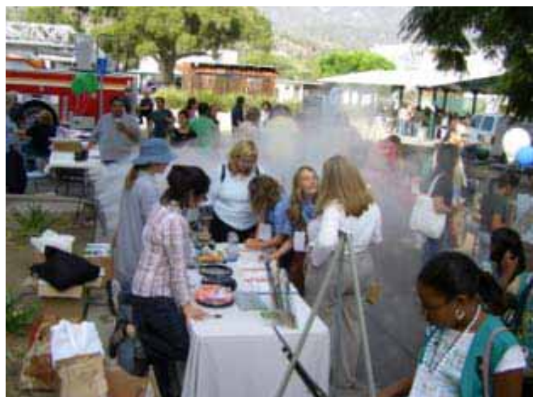
Science Fair Extravaganza at Monrovia High School

Throughout the afternoon students working toward earned recognitions participated in a variety of STEM programs to earn their "Science Planet Passports." Highlights of the event were the inspired presentations of Astronaut Tracy Caldwell and author & actress Danica McKellar.