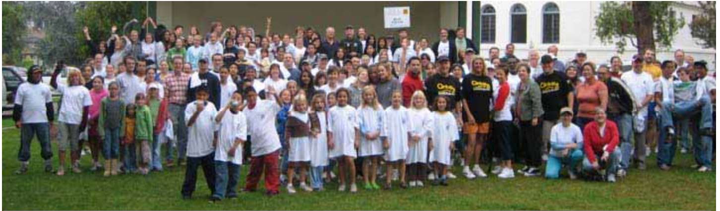
Community organizations met at Library Park in Monrovia at 7:00 AM to organize Make A Difference Day projects

October 27, 2007 was Make a Difference Day, the largest national day of helping others. Here in Los Angeles thousands of volunteers met throughout the basin to celebrate neighbors helping neighbors.