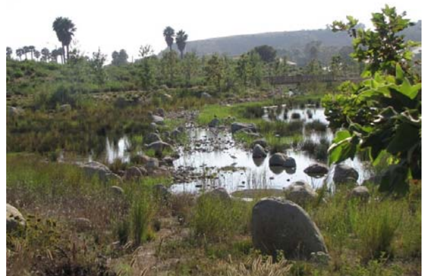
2.6 Million Gallon Detention Pond