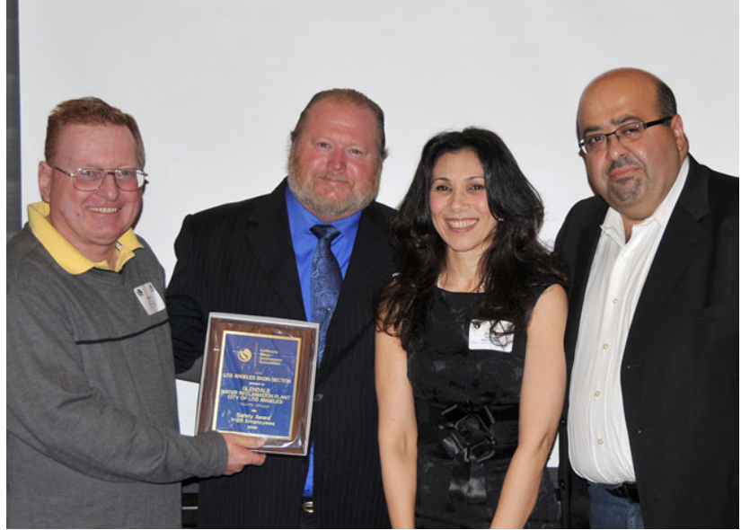
Safety Award Recipient: City of Los Angeles, Bureau of Sanitation. DC Tillman/LA-Glendale WRPs.