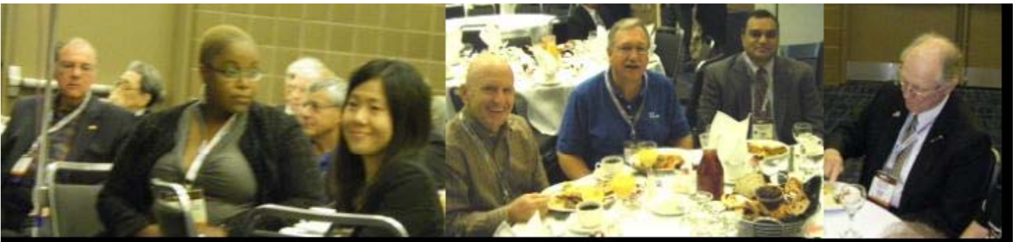
Participants discuss issues (lt), Attendees enjoy networking breakfast (rt).