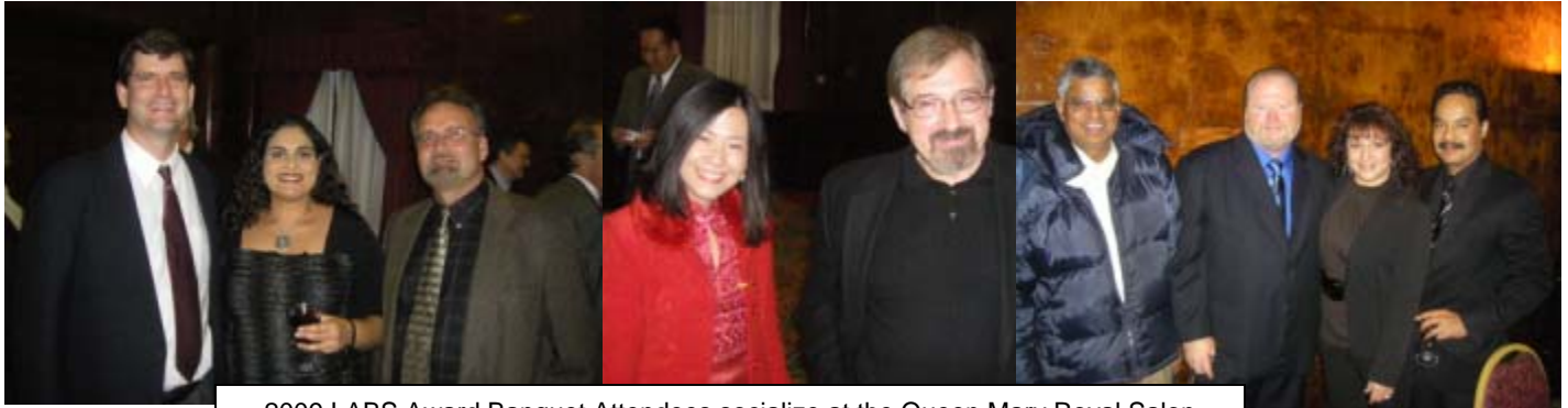
2009 LABS Award Banquet Attendees socialize at the Queen Mary Royal Salon

On January 23, 2010, the Los Angeles Basin Section (LABS) of California Water Environment Association (CWEA) hosted the 2009 annual LABS awards from the Royal Salon of the Queen Mary. The celebration began with an energized social gathering of CWEA leaders, members, and award winners.