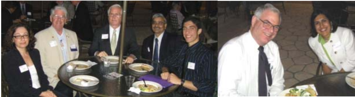
Attendees enjoy dinner and camaraderie at MWD's Los Angeles headquarters

The featured project, CDM's Technology for InSitu Biodegradation of Perchlorate and Nitrate won the Superior Achievement Award . This program, located in Rancho Cordova, developed a patented process called Gaseous Electron Donor Injection Technology (GEDIT) that successfully remediates contaminants in deep soil. CDM collaborated with the U.S. Department of Defense and Aerojet-General Corporation to develop this technology.