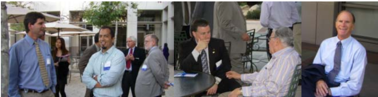
Attendees network in the patio area of MWD's Los Angeles headquarters

The featured project, MWD's Inland Feeder Program won the (E3) Environmental Sustainability Honor Award . The Inland Feeder is a 44-mile long, 12-foot diameter water conveyance system that was planned, designed and constructed with environmental stewardship as one of its guiding principles. The $1.2 billion facility, completed in September 2009, ensures water supply reliability for nearly 19 million residents by mitigating the impact of ongoing climate change on the water supply and potential service interruptions caused by earthquakes on nearby faults. With the Inland Feeder operation, Metropolitan can now fully utilize the largest water supply/conveyance system constructed in Southern California since the 1960s.