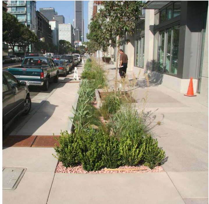
Ultra Urban Biofiltration in Los Angeles