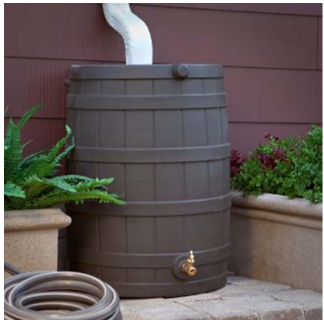
Rain Barrel To Harvest Residential Rainwater

For those of you who are thinking all those laws sound great, but want to know what can be done on a personal level; Mark laid out a few key strategies concerned citizens can use to become expert rainwater harvesters. 1) Pressure Los Angeles Department of Water & Power to increase its rainwater capture budget. 2) Pressure Metropolitan Water District of Southern California to offer economic incentives – Mark suggests $250/af for new water derived from stormwater. 3) Organize cities and counties to take a run at Proposition 218. 4) Encourage the county stormwater user fee vote for spring 2012.