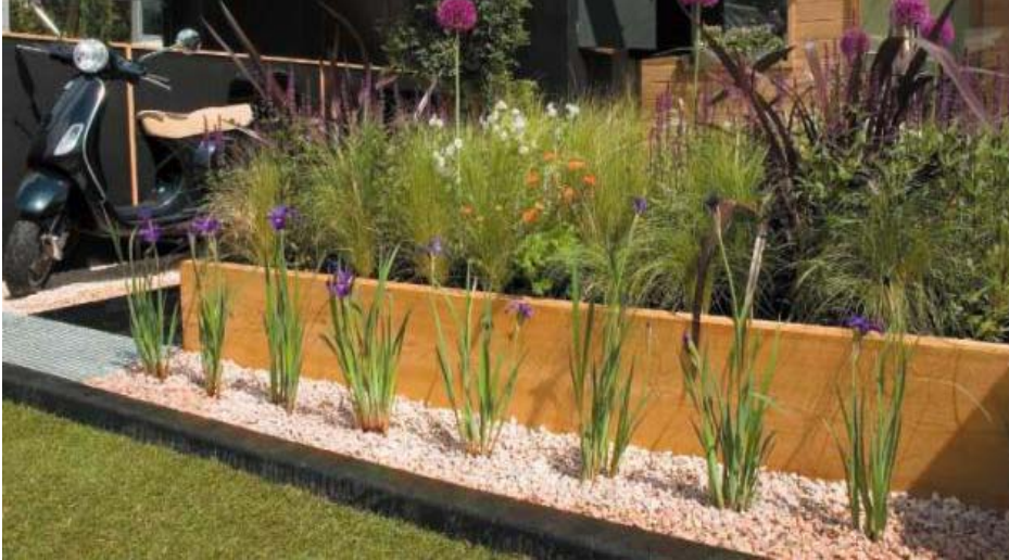
Residential Rain Garden

MS4 requires “all New Development and Redevelopment projects identified in subsection 5.E.II control